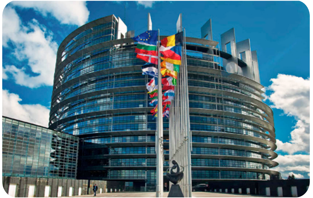
Fig. 5. EU politics from Brussels.

The integrative complexity between European policies and within national government departments can cause very significant blockages and delays, with directives institutionally divided among different administrative agencies. Often progress has been slower than might have been desirable, but these large-scale institutional changes show that although the WFD might be difficult to implement, it has been an important driver to improve water governance and increase focus on, and funding for water management, and the member states are doing a lot to fulfil its requirements.