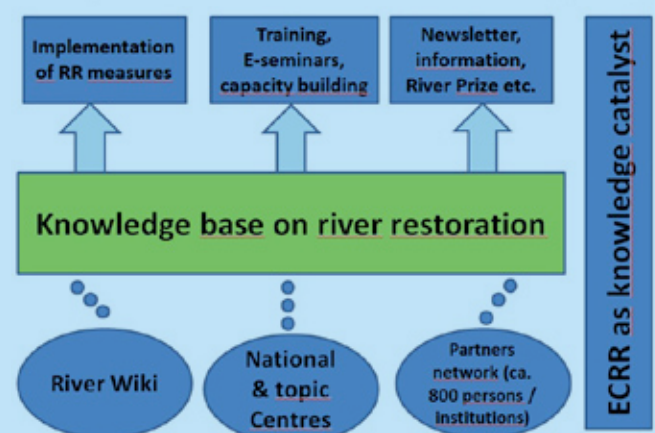
Fig. 3. ECRR Functional organisation: River Restoration Knowledge Network and Catalyst