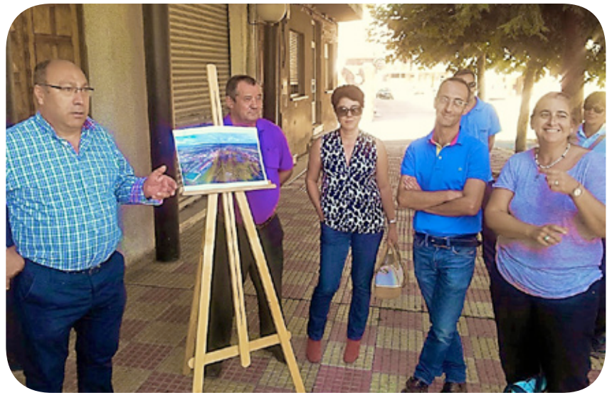
Fig. 4. Public participation in the Órbigo River (Spain) restoration.

The envisioned expansion of hydropower is a threat for the ecological status of Pan-Europe's (pristine) rivers. Guidance on maintaining continuity and environmental flows must be urgently developed and efficiently implemented. The forecasted increase in pressures on water resources from regional or local population growth, economic development, climate change strengthens the need for a paradigm shift towards a more proactive, integrated, adaptive planning, decision making and action. Reaching on-the-ground success will be not possible without persistent and constant learning, and knowledge sharing.