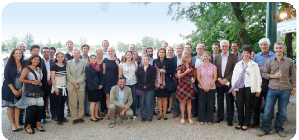
Fig 2. 5th ECRR/RESTORE International River Restoration Conference, Vienna 2013; ECRR Welcome reception